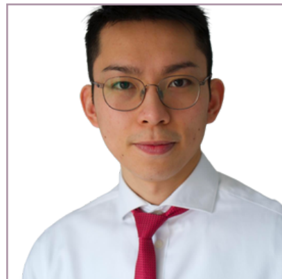
Governor Kief Ho